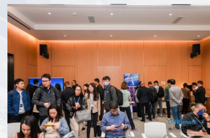
*OffiSmart Salon in Chengdu 2023