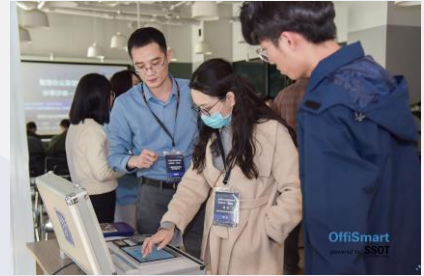
*OffiSmart Salon in Beijing 2023