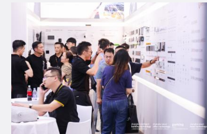
*SSOT Onsite 2023